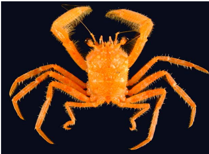
Bifurcate rostrum with spines at base and orbital angle