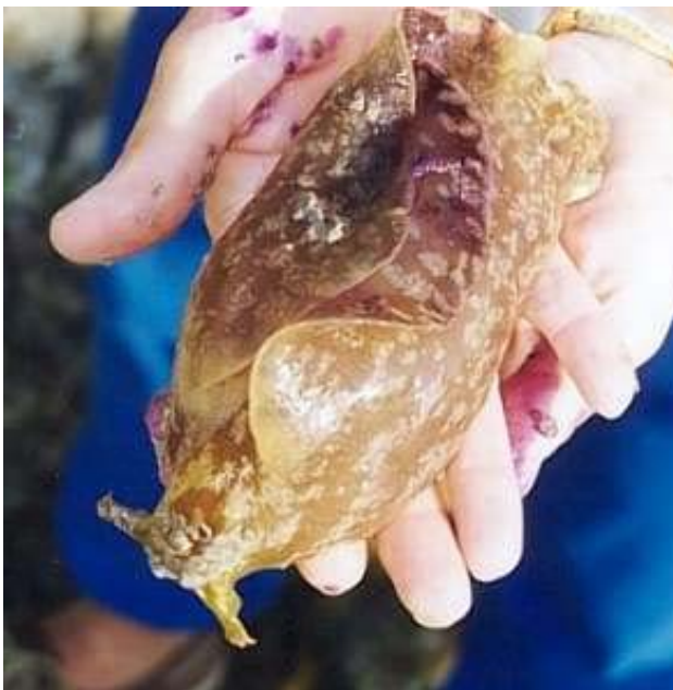
Above: Adult Right: Small juvenile

Range: New Jersey to Brazil; Gulf of Mexico